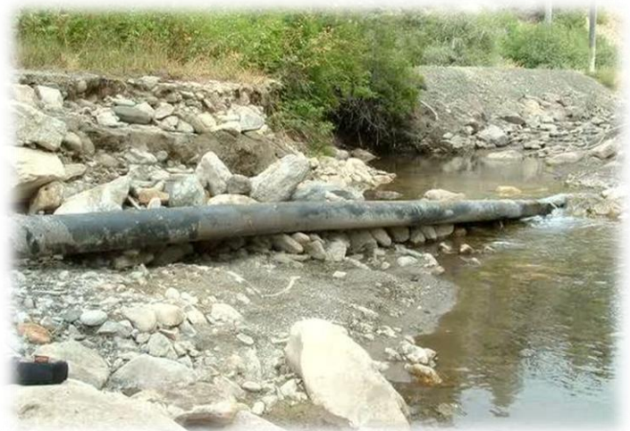
Figure 5: Exposed oil pipeline on Beaver Creek near Helena.