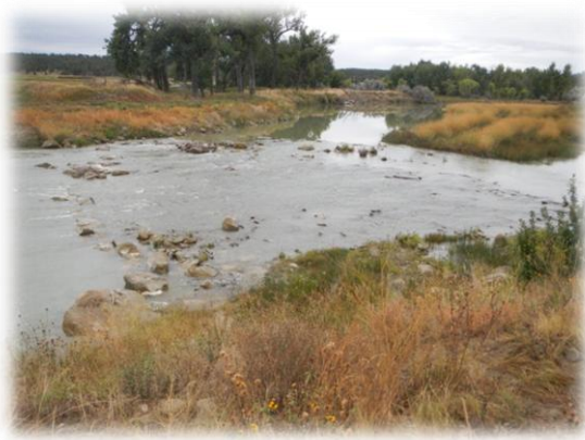
Figure 3: Rock apron placed over a buried inverted siphon on the Musselshell River.