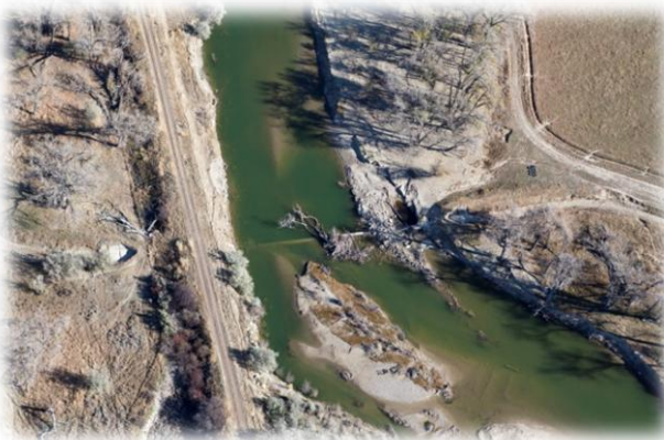
Figure 2: 2011 flood scoured the river bed, exposing the irrigation inverted siphon on the Musselshell River.