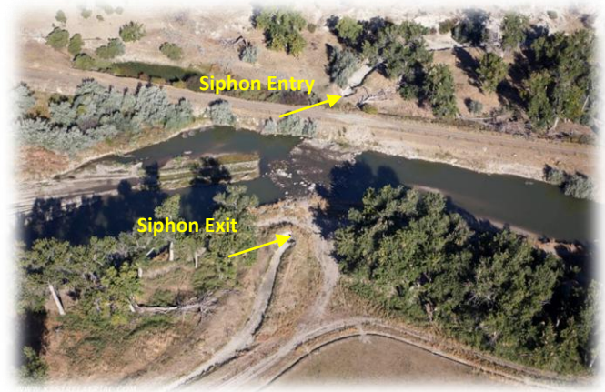
Figure 1: Entry and exit points of an inverted siphon on the Musselshell River.

Pipeline Crossings are pipelines carrying water or petroleum products laid beneath the river bottom. This Best Management Practice (BMP) focuses primarily on irrigation water pipelines, but does include some criteria on permitting oil/gas pipeline crossings. On-site observations of irrigation pipeline crossings and discussions with Musselshell River water users are the basis for much of the information that follows.