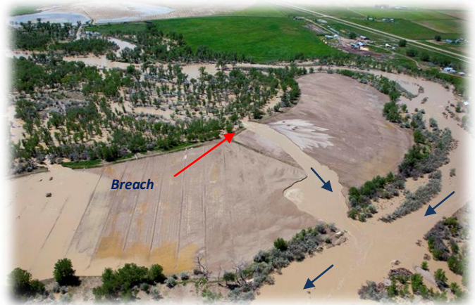
Figure 2. Breached berm and eroded field.

b. Protection of Agricultural Land: Agriculture-related berms constructed as spreader dikes, elevated ditches, or access roads can also affect floodplain access. The 2011 flood showed that in some cases, these floodplain berms caused severe local erosion problems, and exacerbated flooding. Numerous berms served as floodplain dams that backed water upstream, causing floodplain deposition on fields. When the berms were overtopped and breached, flows were focused through the breaches, driving field erosion downstream. Field berms on the floodplain should be constructed as low as possible, to allow floodwaters to continue down valley as shallow