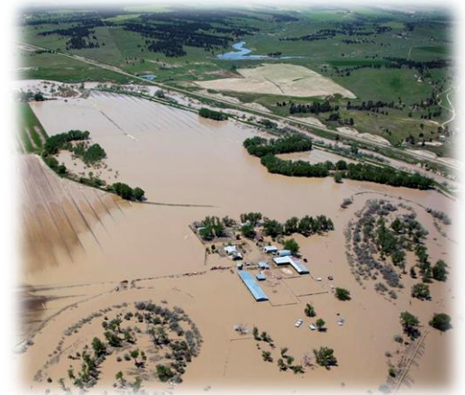
Figure 2. Flooding of floodplain structures on Musselshell River during 2011 flood

a. Protection of Infrastructure: Extensive flooding in 2011 resulted in significant property damage due to inundation of residences and outbuildings. Homeowners in the floodplain have expressed an interest in constructing berms to protect their existing homes or outbuildings from future floods. But by building berms, more floodplain becomes isolated, which will reduce the ability of the floodplain to dissipate flood energy in the future. Berms concentrate flows in the channel, which can increase bank erosion rates and drive downcutting or channel widening. Infrastructure-protection berms should therefore have a footprint that is as small as possible to limit the impact on floodplain and channel function. Adjacent to homes, berms can be constructed as topographically subtle, landscape features that are placed close to the buildings of concern. To minimize overall impacts, new construction should be located outside of the river floodplain. Consideration should be given to moving corrals, outbuildings, homes and other structures if possible away from the river's edge and floodplain or to areas higher in the floodplain to eliminate or reduce the size of berm needed to protect the structure. Berms should be placed without the need for riprap.