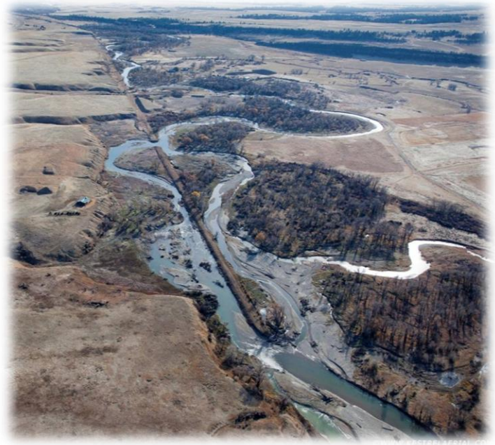
Figure 1. View to east of railroad dike breached during 2011 flood.