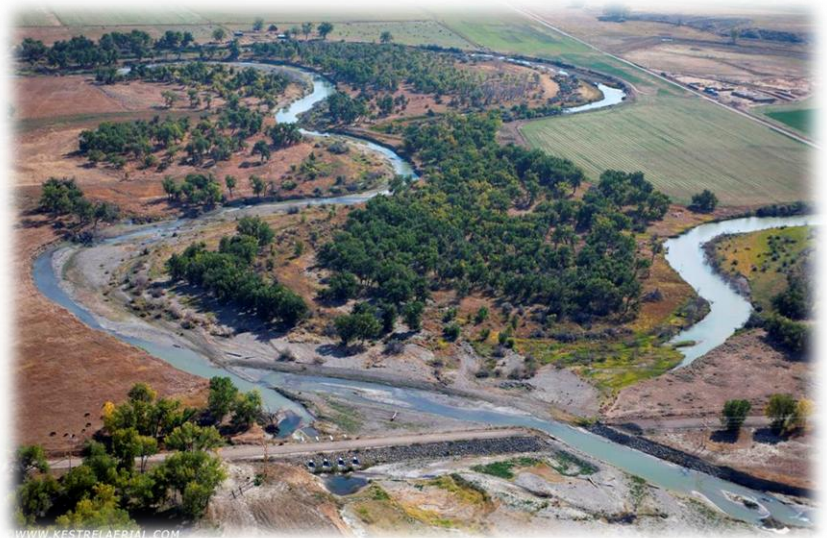
Figure 5. View downstream of Harvey Road Bridge site showing newly constructed high flow culverts to left of channel.