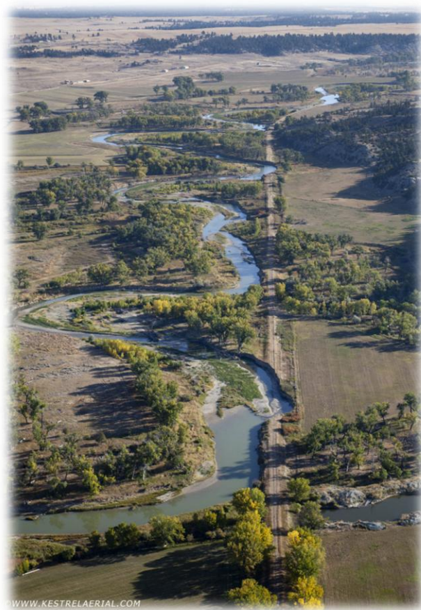
Figure 8. View down-valley of multiple breaches; downstream breach serves as return flow point.

grade is an un-maintained, discontinuous floodplain berm that runs largely parallel to the river corridor upstream of Melstone. As the berm continues to naturally breach and decay, it will become an increasingly severe liability to corridor residents and agricultural producers. Relying on an unmaintained, locally breached berm as a de-facto flood protection measure is a poor long-term