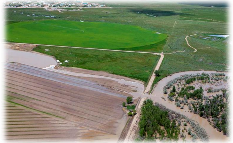
Figure 3. Breached road prism and upstream erosion.