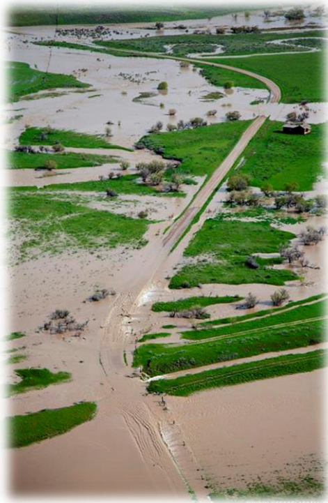
Figure 4. Road prism forming floodplain dike/dam during 2011 flood.