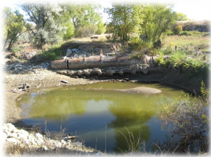
Figure 9. Railroad berm breach where flows overtopped from the backside of the berm.

Many producers have plugged or reconstructed damaged berms to restore the function of the berm, be it road access, flood control, or irrigation management. With most low berms on agricultural fields, the hydrologic impact of these repairs is low. However, with larger berms, road crossings, or especially the railroad berm, repairs will re-isolate large floodplain areas. Whether or not the breaches are plugged should consider the overall need for the project, other breach locations and floodplain drainage patterns. Where berms overtopped from the landward side for example, flows were returning to the stream corridor over the berm because there was no better relief valve. In these areas especially, maintaining an overflow return point through the breach will reduce the risk of overbank flows becoming trapped on the floodplain and possibly damaging areas normally outside of the floodplain. These breaches can be reinforced as swales that still allow transportation access, and can be hardened as necessary to prevent erosion or headcutting.